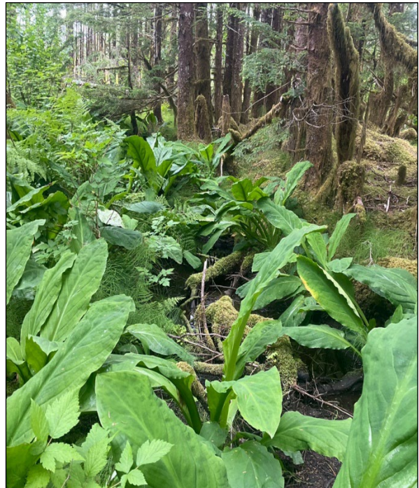
Figure 2.–Stream channel at waypoint 750.