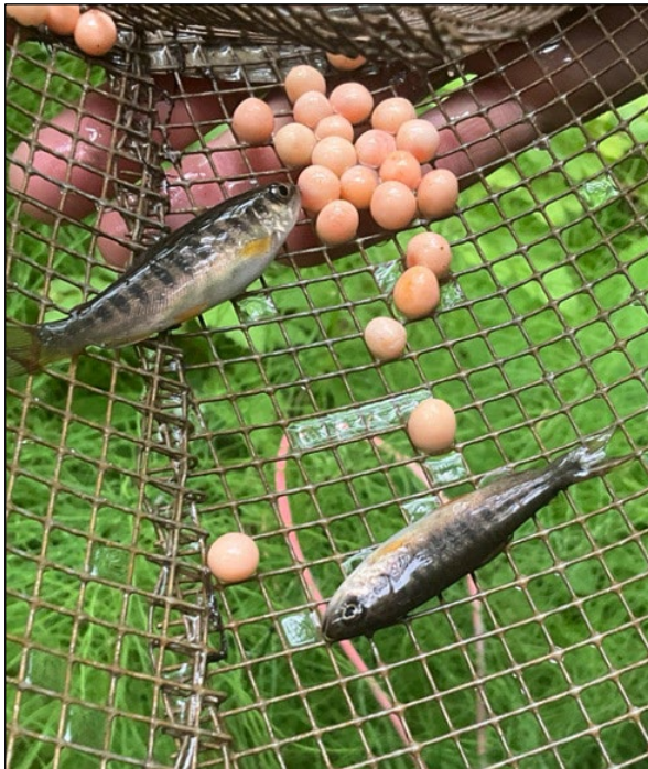
Figure 1.–Juvenile coho salmon caught at waypoint 750.